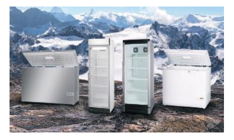
Warehouse Clearance - Page 3