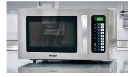
Microwave Bulk Deal - Page 4