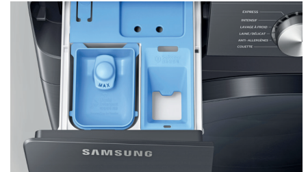
Samsung Stacking Deal - Page 4