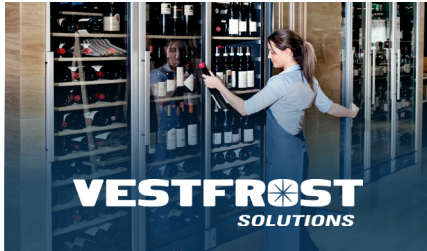
Brand Of The Month - Page 2